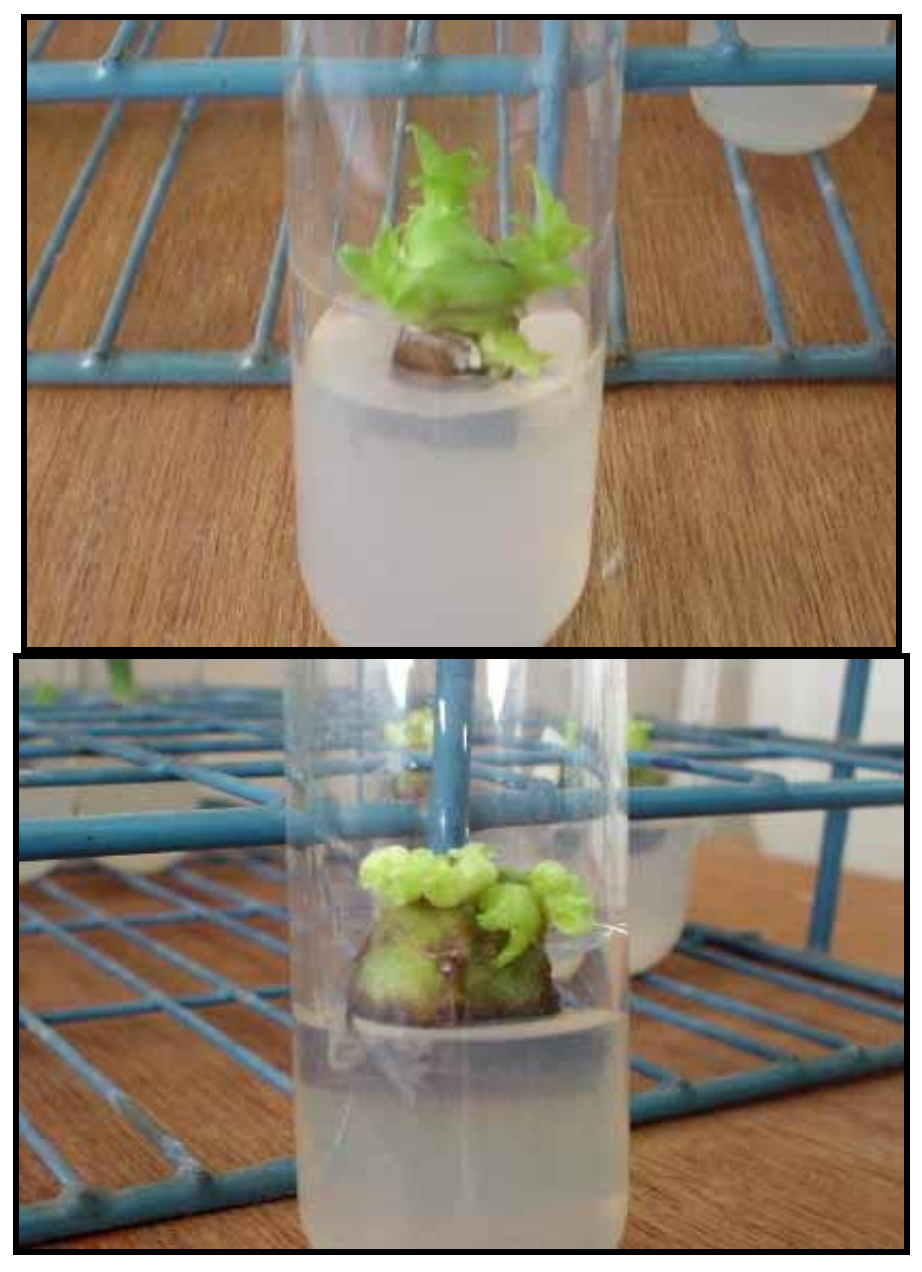
Fig. (1): Axillary buds (right photo) and adventitious shoots (left photo) formation of nodal segment explants of pineapple, after 8 weeks in culture.