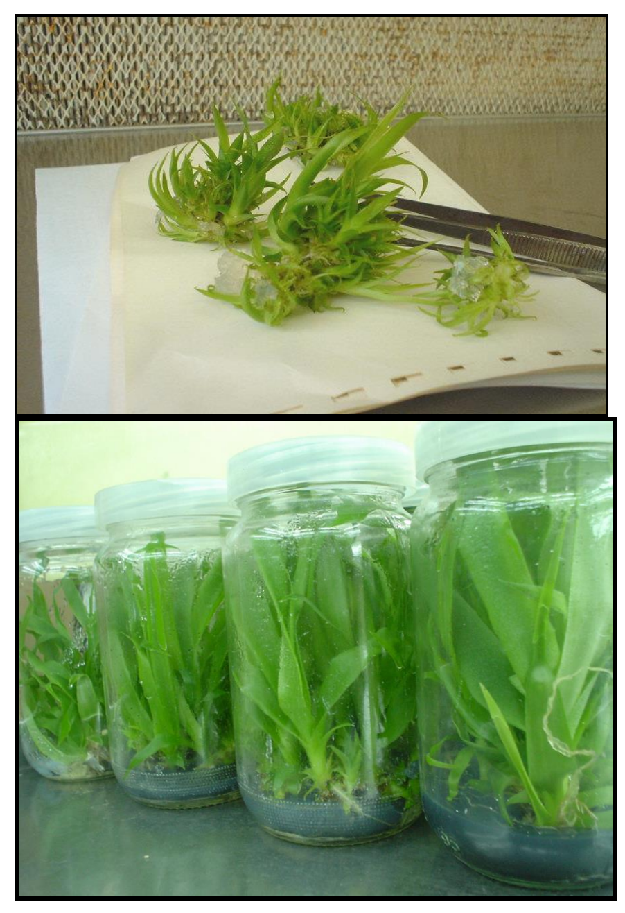
Fig. (3): Pineapple shoots proliferated on the liquid medium (right photo), ideal- in vitro plantlets make ready for transplantation (left photo).