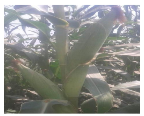
6) Normally and healthy ears.