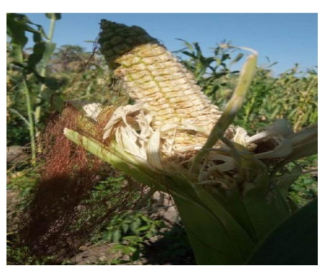
4) 50% damage.