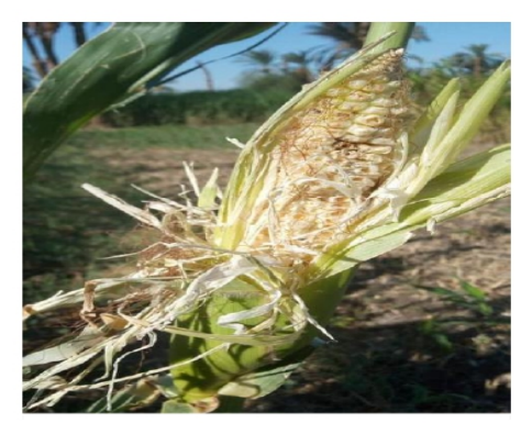
5) 75 % damage.