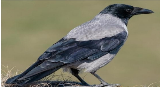
7) Hooded crow, C. corone sardonius

Fig. (3, 4 and 5). Show crows all grains after lifting husks in milky stage of maze ripening.